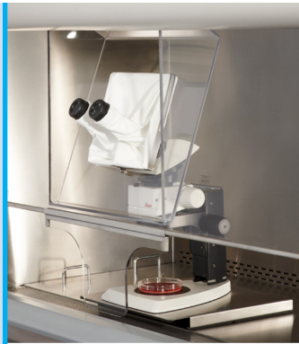
This LabGuard BSC was fitted with a microscope viewing window to accommodate workflow specializing in human cell tissue research.