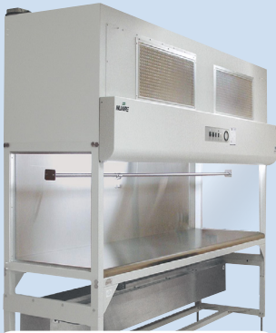
This Class I BSC was created at a nominal width of 8' [2.4 m], with clear polypropylene sidewalls, and a custom mounted IV bar.

If your lab requires a unique solution, give us a call; we love a challenge.